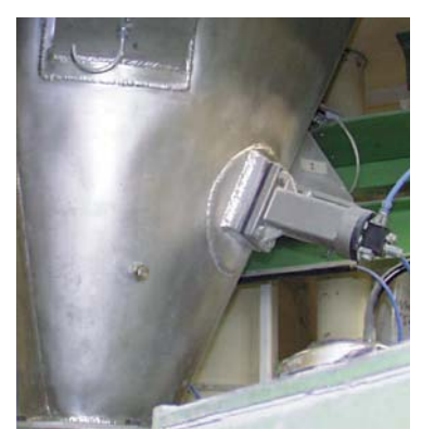
Cleaning bunker walls