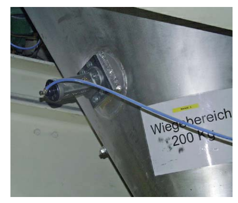
Cleaning weighing containers