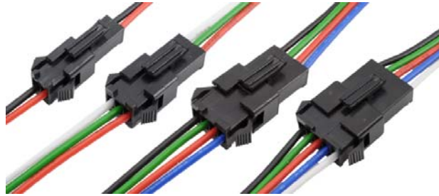
2.5mm pitch wire to wire connector set.