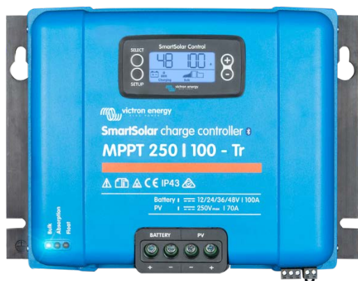
Solar Charge Controller MPPT 250/100-Tr with pluggable display