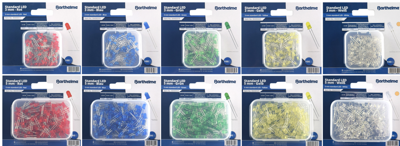
ø 3 mm LED Diode