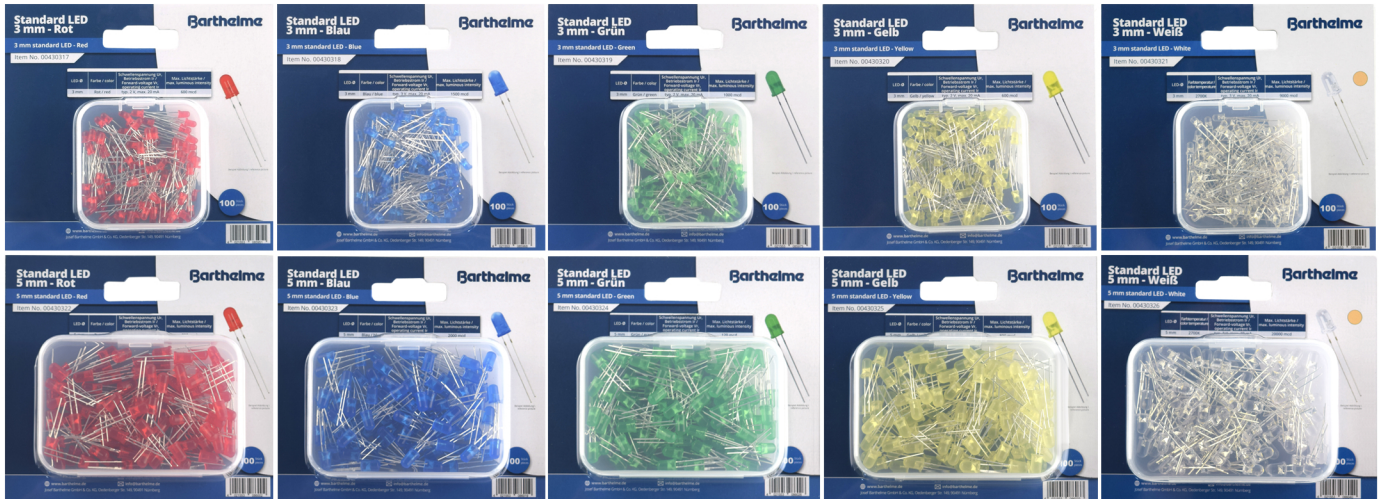
ø 3 mm LED Diode