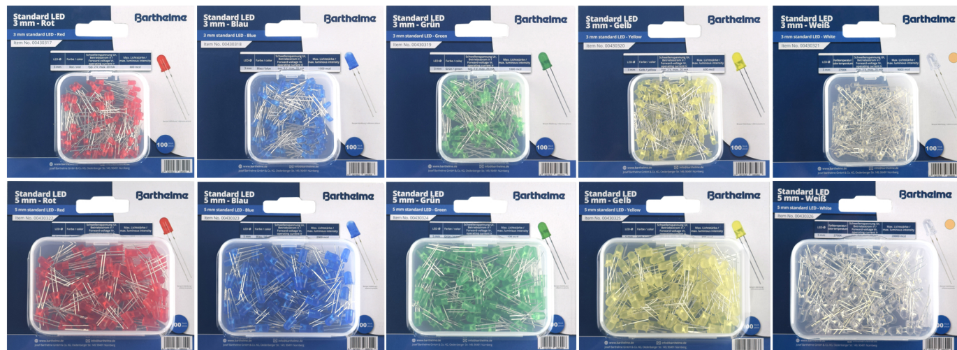
ø 3 mm LED Diode