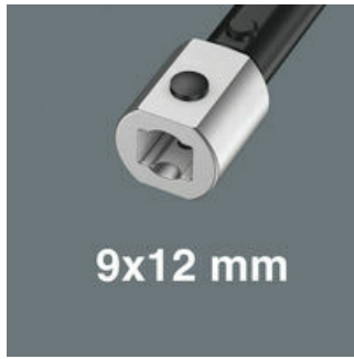
With safety pin

For torque wrenches of the Click-Torque X series with 9x12 mm holder.