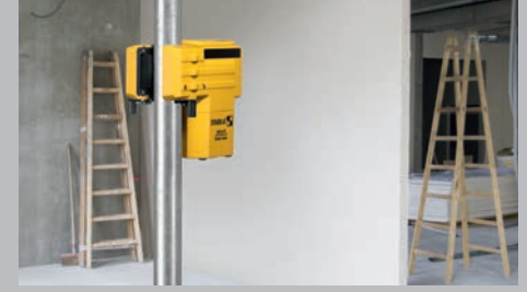
Integrated clamping device