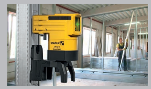
Strong rare-earth magnet system