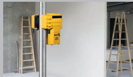
Integrated clamping device