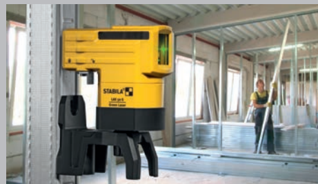
Strong rare-earth magnet system