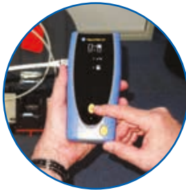
Autotest from remote unit for one person testing