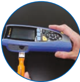
Replaceable RJ45 contacts