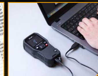
Clockwise from top: Pinless mode; MR02 pin probe included; USB download; Save as .CSV file in Excel