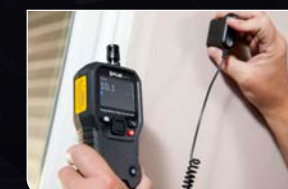
Pin or Pinless Measurements

See the accessories page of this brochure to view our full line.