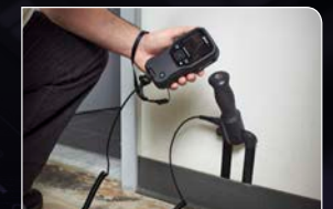
Field Replaceable T/RH Sensor