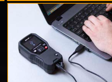
Clockwise from top: Thermal image guides you to moisture Pin probe included Download images