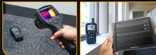
Clockwise from top: Integrated pinless moisture sensor; Connect METERLiNK cameras and MR77; View measurements on smart devices