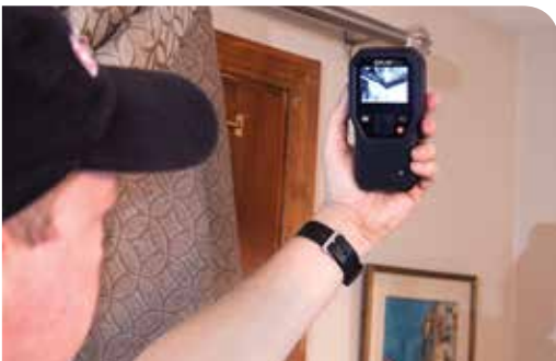
FLIR MR160 scanning ceiling & wall joint for moisture issues.