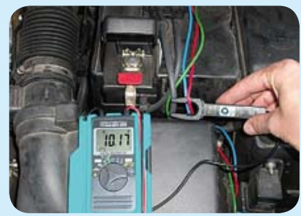
Servicing a car