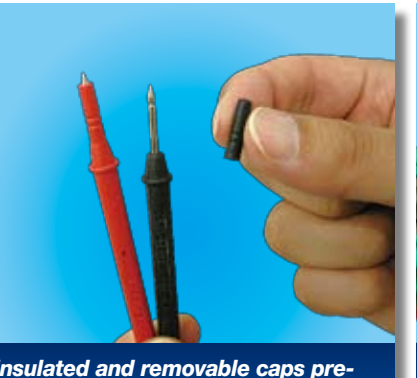
Insulated and removable caps prevent shortening of IC legs for proving high density component boards.