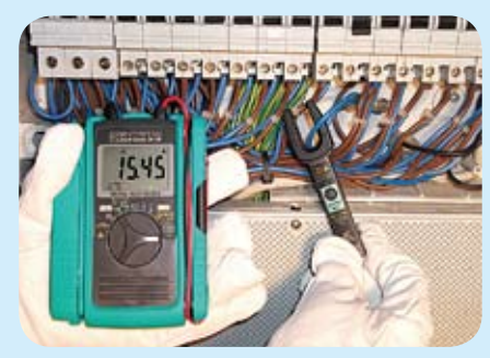
Measuring current in a Switchboard