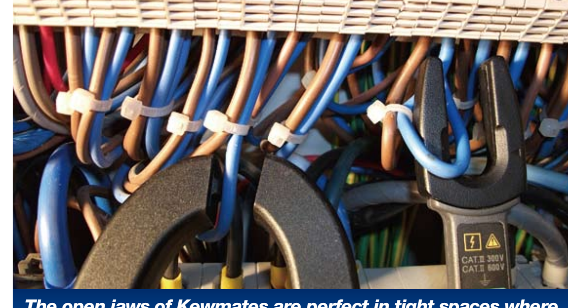
The open jaws of Kewmates are perfect in tight spaces where a normal clamp meter is too big or wires are too short.