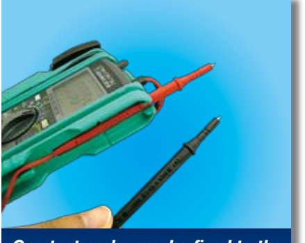
One test probe can be fixed to the meter to help get the job done safer and faster.