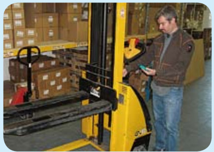
Servicing a Forklift