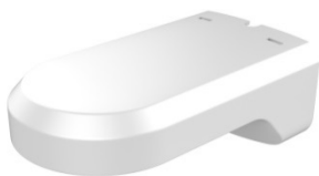
HIA-B404-PT Wall Mounting Bracket