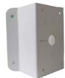
HIA-B201 Corner Mounting Bracket