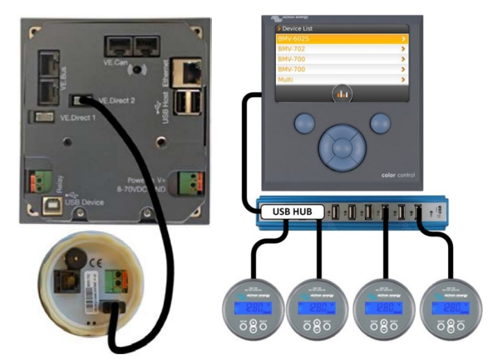
A maximum of four BMVs can be connected directly to the Color Control. Even more BMVs can be connected to a USB Hub for central monitoring.

The powerful Linux computer, hidden behind the color display and buttons, collects data from all Victron equipment and shows it on the display. Besides communicating with Victron equipment, the Color Control communicates through CAN bus (NMEA2000), Ethernet and USB. Data can be stored and analyzed on the VRM