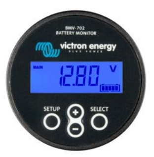
BMV 702 Black