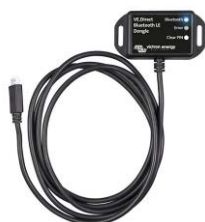
VE.Direct Bluetooth Smart dongle (must be ordered separately)

An excessively high or low battery voltage is indicated by an audible and visual alarm, and a relay for remote signalling.