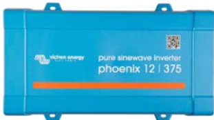
Phoenix 12/375 VE.Direct