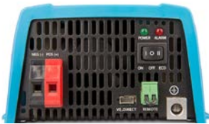
Phoenix 12/375 VE.Direct