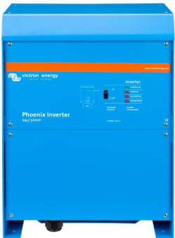
Phoenix Inverter 24/5000