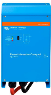
Phoenix Inverter Compact 24/1600

The possibilities of paralleled high power inverters are truly amazing. For ideas, examples and battery capacity calculations please refer to our book "Energy Unlimited" (available free of charge from Victron Energy and downloadable from www.victronenergy.com ).