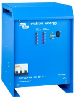
Skylla TG 24 50 3 phase

To learn more about batteries and charging batteries, please refer to our book 'Energy Unlimited' (available free of charge from Victron Energy and downloadable from www.victronenergy.com ).