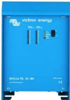
Skylla TG 24 50