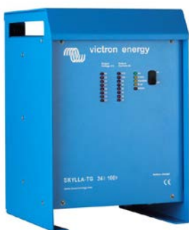
Skylla TG 24 100