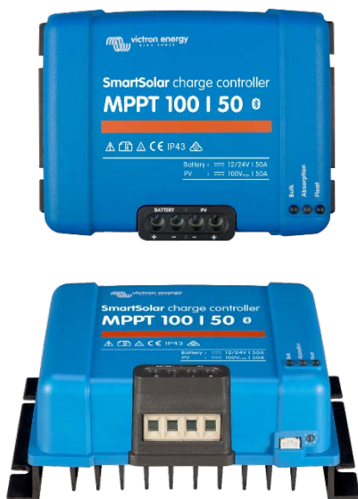
SmartSolar Charge Controller MPPT 100/50