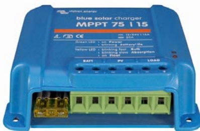
Solar Charge Controller MPPT 75/15