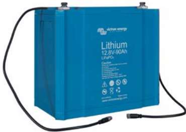
12,8V 90Ah LiFePO 4 Battery

Our 12V BMS will support up to 10 batteries in parallel (BTVs are simply daisy-chained).