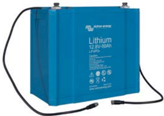
12,8V 60Ah LiFePO 4 Battery