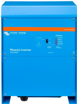
Phoenix Inverter 24/3000