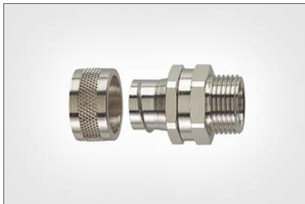
HeloGuard PCS-SM Swivel External Thread.