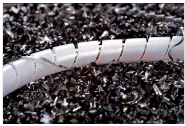
SPBA spiral binding made of polyamide offers excellent protection against abrasion.