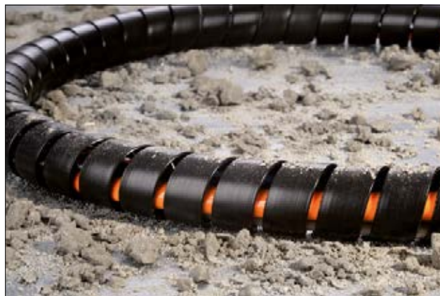
Spiral binding - extremely robust and abrasion resistant.