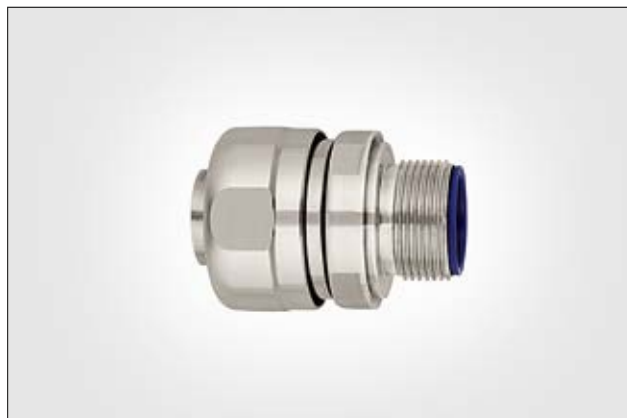
HelaGuard PSRSC-FMCFSS stainless steel fittings for applications in the food-processing industry.