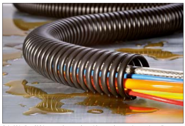
Spiral binding SPS is very robust and provides good protection against oil.