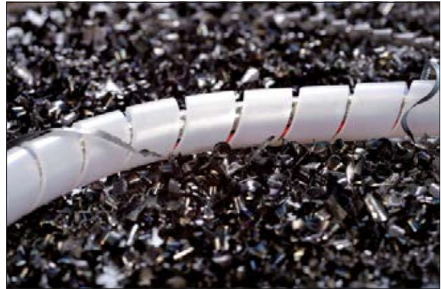
SPBA spiral binding made of polyamide offers excellent protection against abrasion.