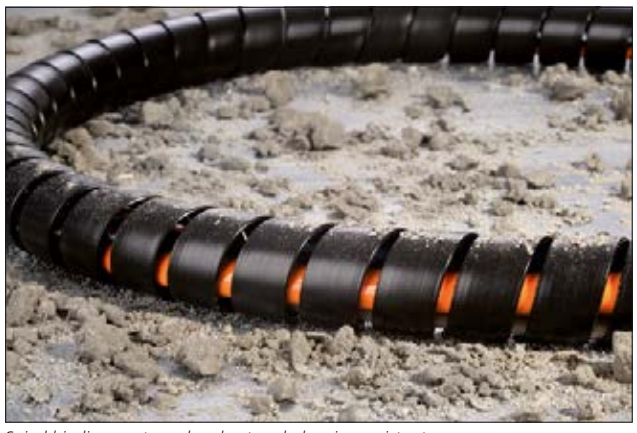
Spiral binding - extremely robust and abrasion resistant.