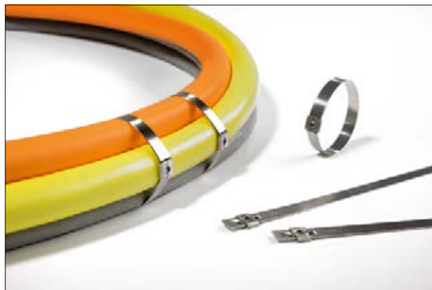
Stainless Steel Cable Ties MST-Series.