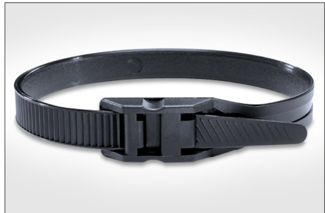
Low profile cable tie, LPH-Series.