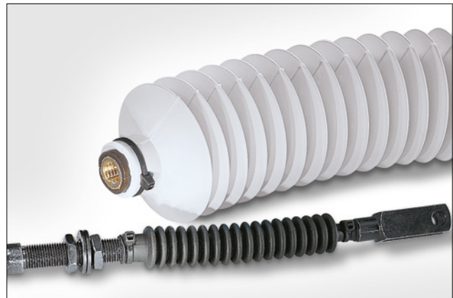
CTT ties installed on flexible gaiters.