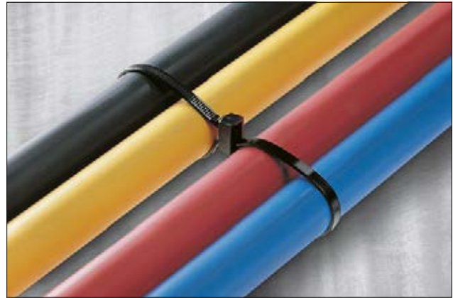
Parallel routing of two cable bundles using DH-Series. The double head creates an inside and an outside serrated loop.