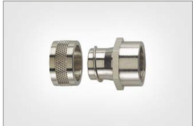
HeloGuard PCS-FF Fixed Internal Thread.