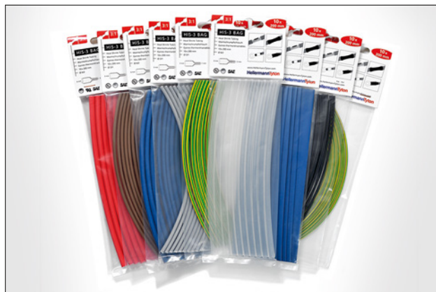
HIS-3 BAG available in seven colours and four sizes.