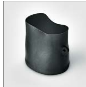
150 Series supplied.