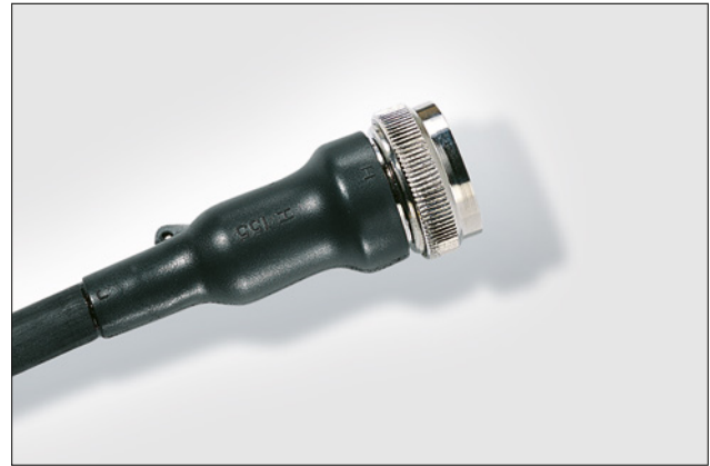
150 Series boot recovered onto a connector.

For Material / Adhesive information please refer to page 244.