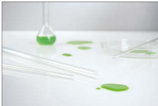
TFE is available in either 2:1 or 4:1 shrink ratios.

Cut lengths available on request. Please contact us!