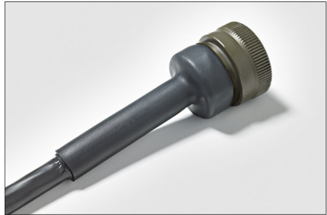
PTA300 and PTA400 offer high shrink ratios and protection against humidity.