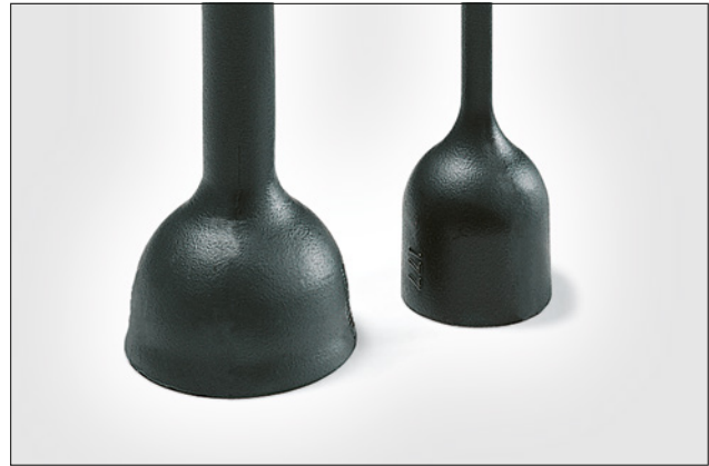
177-1-G as supplied / fully recovered.