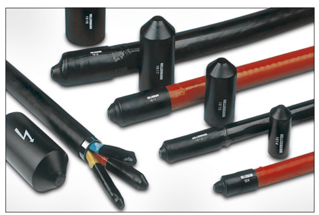
The appropriate end cap for every cable diameter, and cable types.