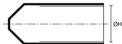
a: Expanded form (supplied)