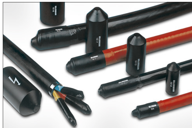
The appropriate end cap for every cable diameter, and cable types.