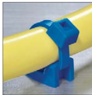
Fixing Tie Mount KR6G5-E/TFE.