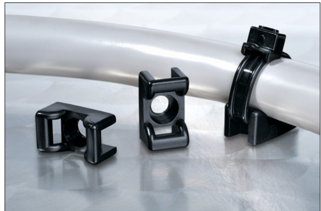
Cable Tie Mounts KR6G5, KR8G5 and CTM.