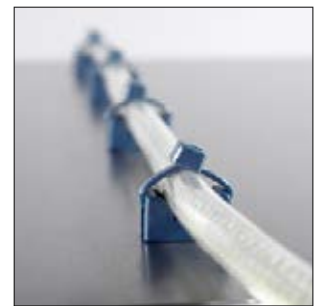
Detectable fixing solution containing of MCKR Mount and MCTS cable tie.