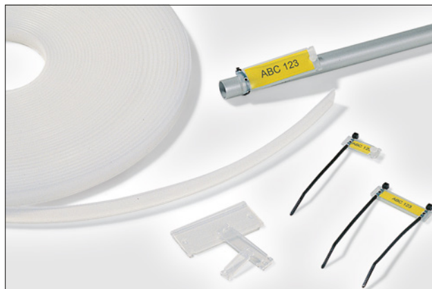
Multi-purpose identification potential: Helafix HC and HCR.