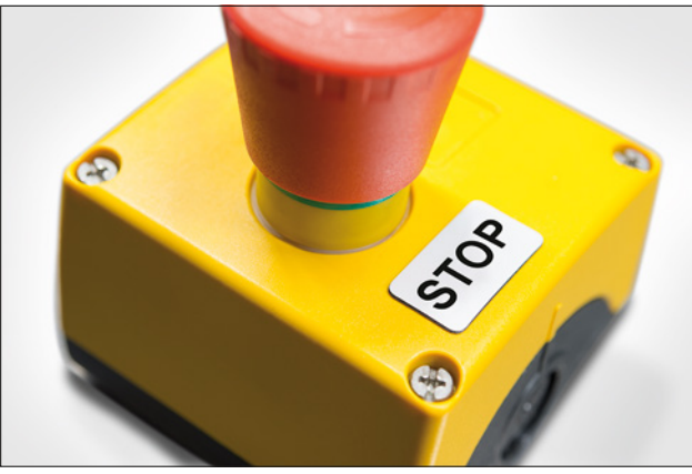
Panel labels are an ideal replacement for engraved plates.