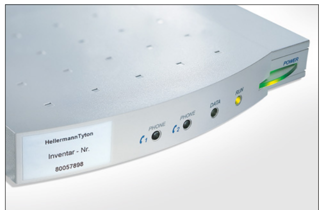
Helatag label for a permanent asset identification.