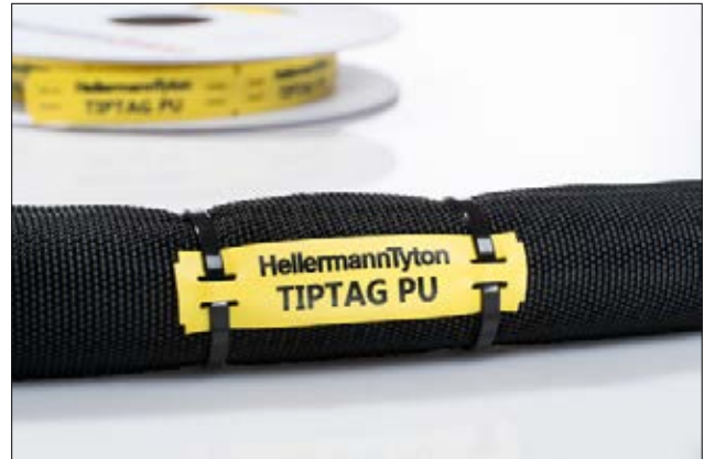
The printed mark has a tattoo-like permanency.