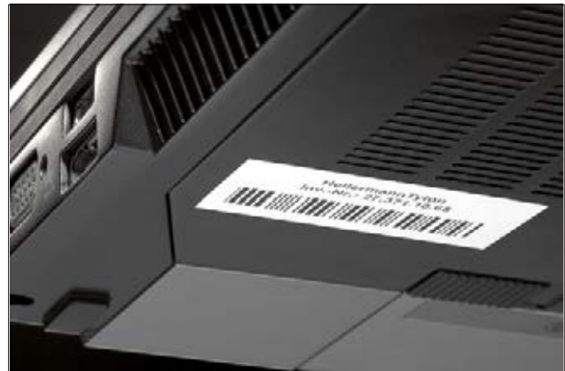
Helatag label for a permanent asset identification.