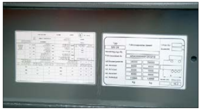
Type plate of an HGV trailer with protective laminate.