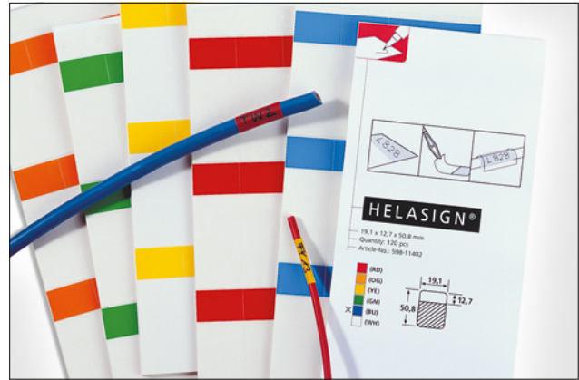
Always on hand: Labels in a convenient, pocket sized and lightweight booklet.